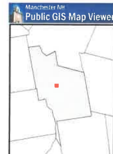
Area Map Showing Extent Of Map At Left