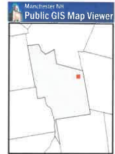
Area Map Showing Extent Of Map At Left