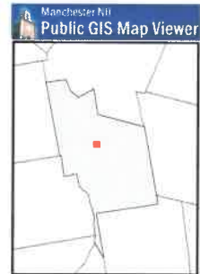
Area Map Showing Extent Of Map At Left