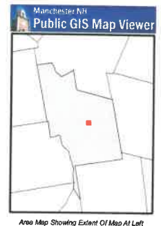
Area Map Showing Extent Of Map At Left