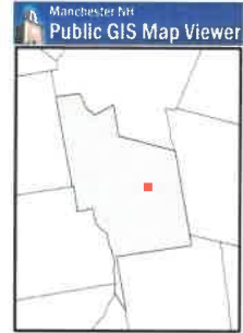
Area Map Showing Extent Of Map At Left